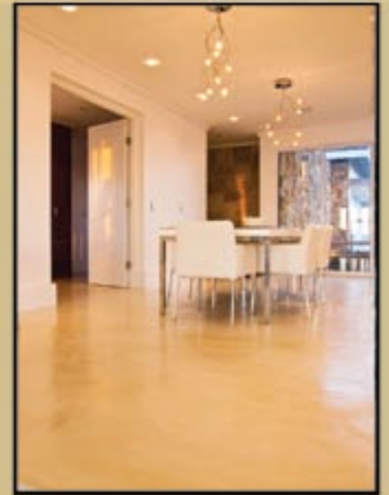
Seamless Floor Screeds