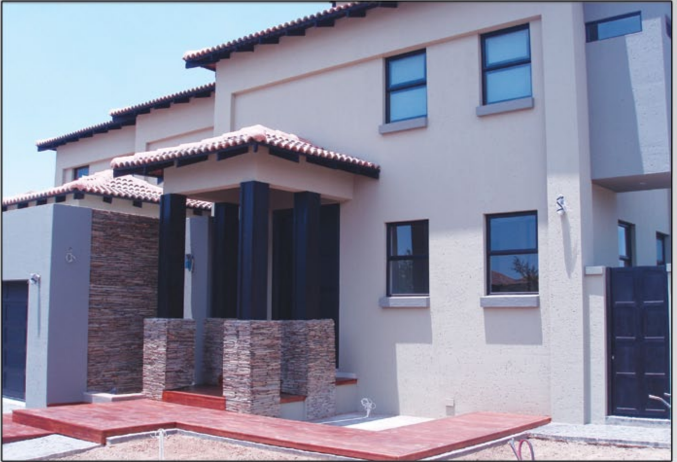
Liquid Naturals is available in 48 Natural colours to suit your building surroundings.