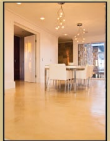
Seamless Floor Screeds