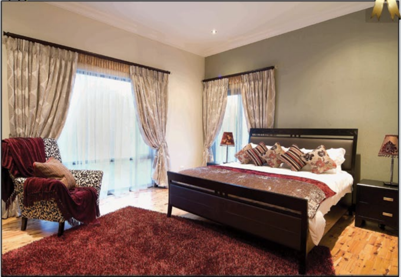
Platinum Sheen offers a high quality acrylic, washable sheen finish and carries a 7 year guarantee.