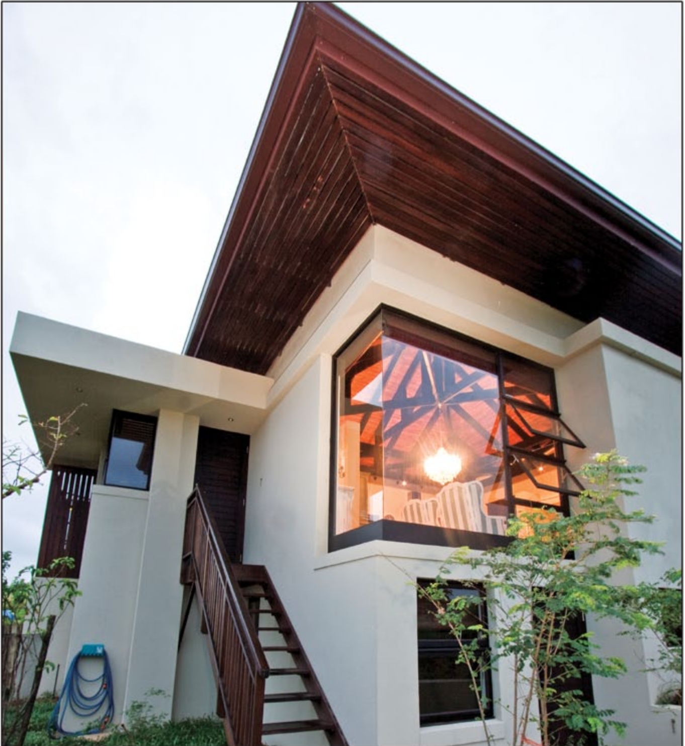
Platinum XP Velvet is ideal for exterior use as seen above or for interior applications.

feel, unique to the Platinum Range. Due to the excellent abrasive - and UV resistant properties of the product, it can also be used for exterior applications where a hard wearing, washable coating is required. The Platinum Acrylic Range has a 7 year product guarantee.