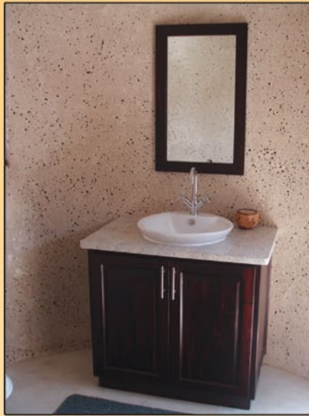
Stucco combined with Shellac to resemble a beautiful shell speckled appearance.