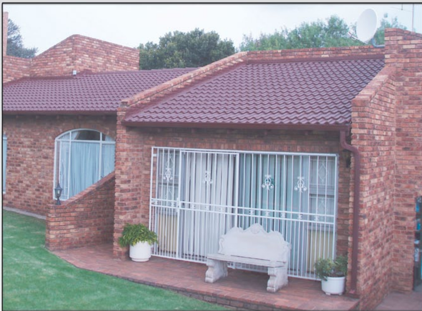
High strength Top Hat Roof Paint Brown, used on cement roof tiles above.