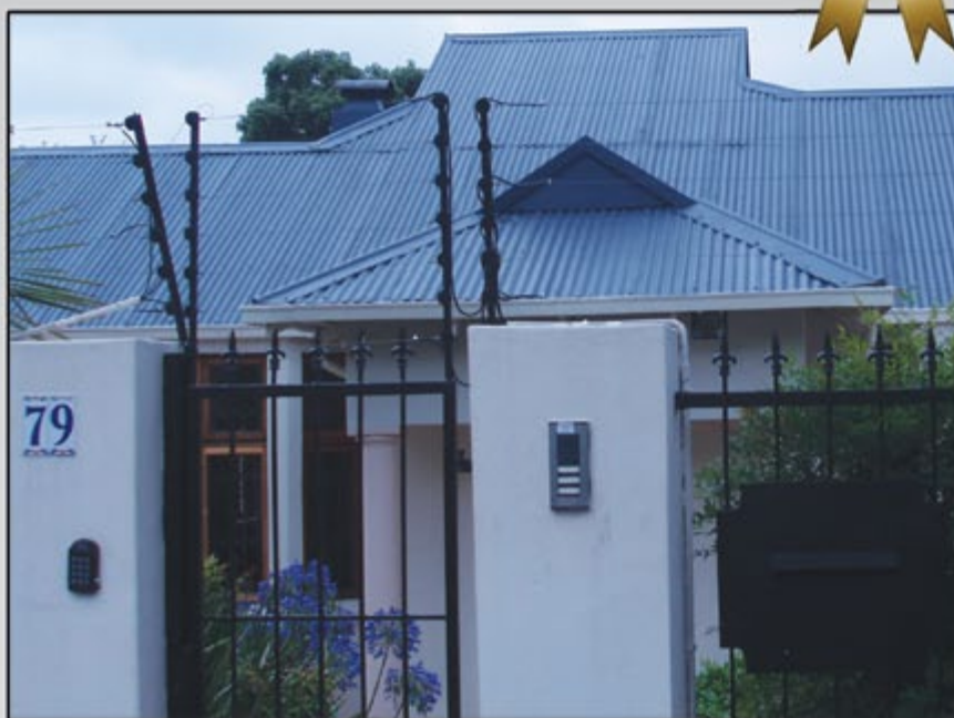
UV resistant Top Hat Roof Paint is suitable for all types of roofs including metal roofing.

Africote's Top Hat Roof Paint is a high quality, pure acrylic coating specifically designed for application onto roof tile and/or corrugated iron roofs. The high flexibility and anti-weathering properties of the product guarantees that your roof enjoys the best possible protection in our harsh African environment. Top Hat Roof Paint is available in 8 standard colours. For large projects e.g. townhouse developments, special custom colours can be manufactured in batch lots. Top Hat Roof Paint has a 5 year product guarantee. For the terms and conditions of the guarantee request this from the factory.