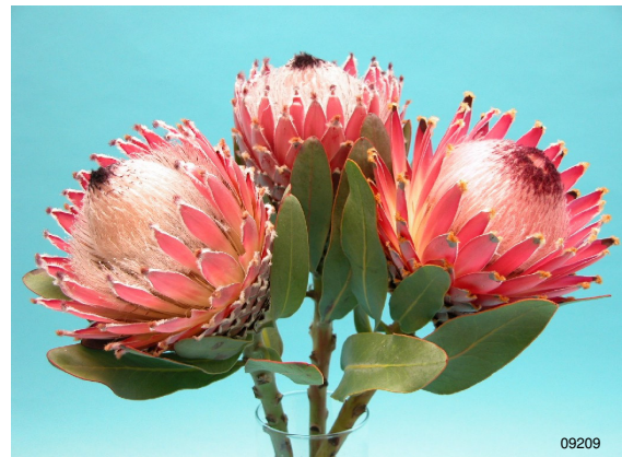
Treatment: Chrysal Clear Professional 3 liquid Total vase life: 20 days Photo taken: day 13