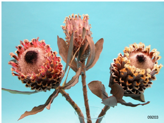
Treatment: water Total vase life: 12 days Photo taken: day 13