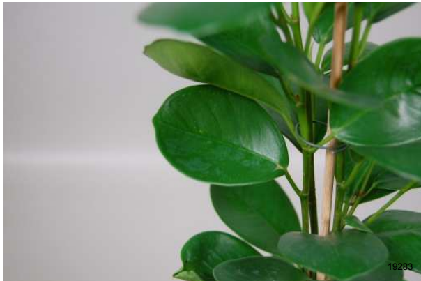
Treatment: none Photo taken: day 12