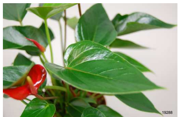
Treatment: Chrysal Leafshine (aerosol) Photo taken: day 12