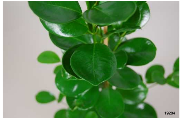
Treatment: Chrysal Leafshine (aerosol) Photo taken: day 12