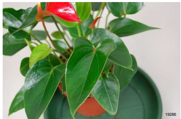
Treatment: Chrysal Leafshine (aerosol) Photo taken: day 12