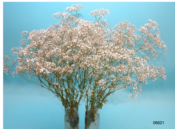
Treatment: Chrysal OVB Total vase life: 12 days Photo taken: day 12