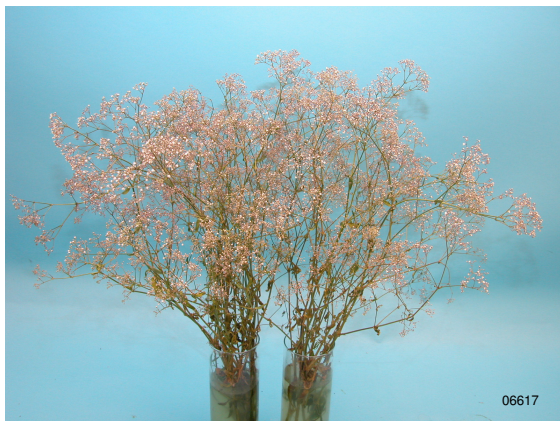
Treatment: water Total vase life: 8 days Photo taken: day 12