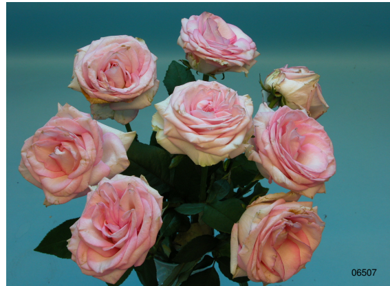
Treatment: Chrysal RVB Clear Total vase life: 15 days Photo taken: day 12