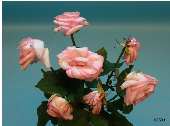
Treatment: water Total vase life: 12 days Photo taken: day 12