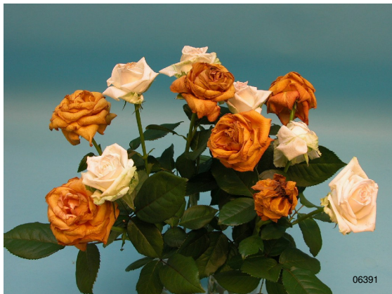
Treatment: water Total vase life: 8 days Photo taken: day 11