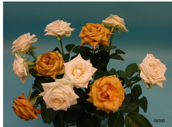
Treatment: Chrysal RVB Clear Total vase life: 11 days Photo taken: day 11