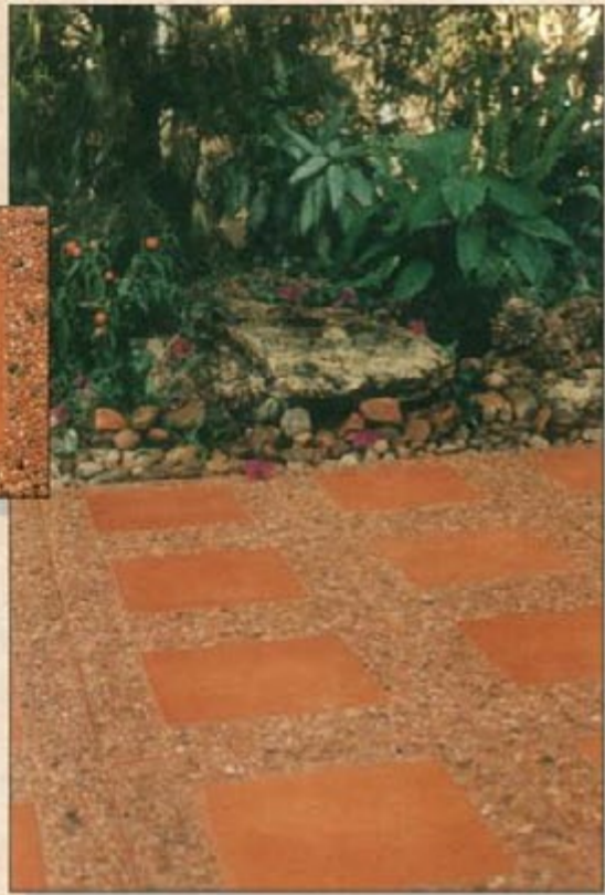
Patio / landscape paving

Non-slip Terracotta relief incorporates a band of natural brown river pebbles sourced from our local rivers. The tile and textures are unique and interesting to the eye and ideally used externally.