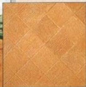
Suntan Weave (400 x 400mm)