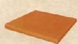
Single Arris 300 x 300 x 35mm 400 x 400 x 35mm 450 x 450 x 50mm

Colours portrayed are as accurate as printing allows. (Please request sample before ordering/specifying).