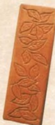
(300 x 100 x 25mm) Listello

Decorative accessories include "hand crafted" Rosettas and Listelli