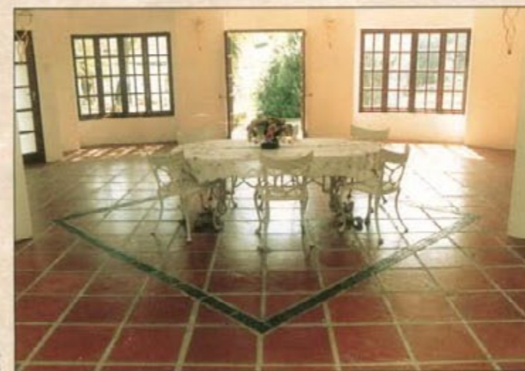
Dining room with Terracotta Rustic (400 X 400mm) using contrasting green Listelli.

The Cotto Stone range is available in our 4 earthy colours and its stone-like appearance is non-slip yet pleasant to walk on barefoot, making it ideal for pool surrounds and areas where a natural floor paving texture is sought after.