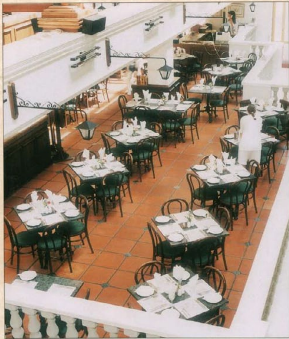
Terracotta Rustic (400 x 400mm) - Restaurant Village Walk JHB

The earthy range of Cotto Veneto tiles from Union