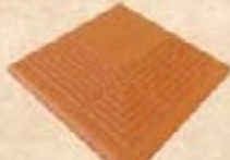
LM Corner Step/Coping 300 x 300 x 35mm