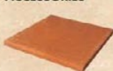
OSL Step/Coping 400 x 400 x 35mm