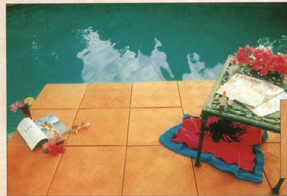
Non-slip pool surrounds