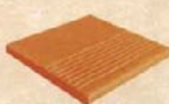
LM Step/Coping 300 x 300 x 35mm