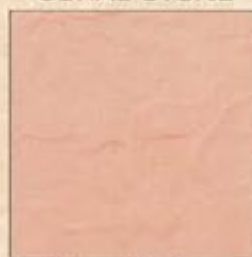
COTTO VENETO NON-SLIP CORAL STONE