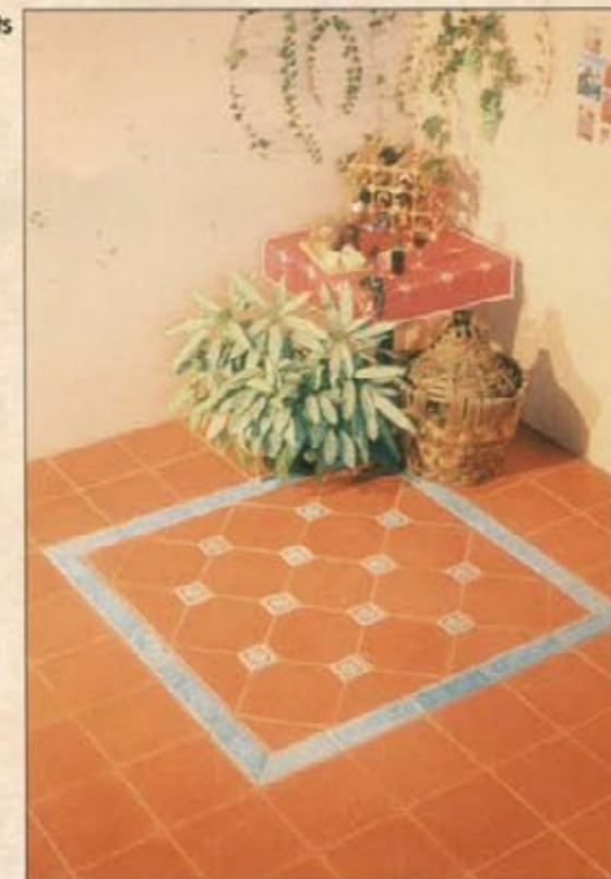
Terracotta Rustic (300 x 300mm) - Wine cellar with Blue Rosettas and Listelli