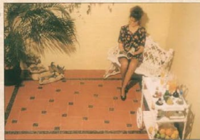
Terracotta Rustic (300 x 300mm) - Sun deck with Verde Rogallo Marble insets