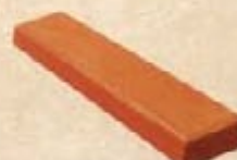
Skirting 400 x 80 x 35mm 300 x 75 x 35mm